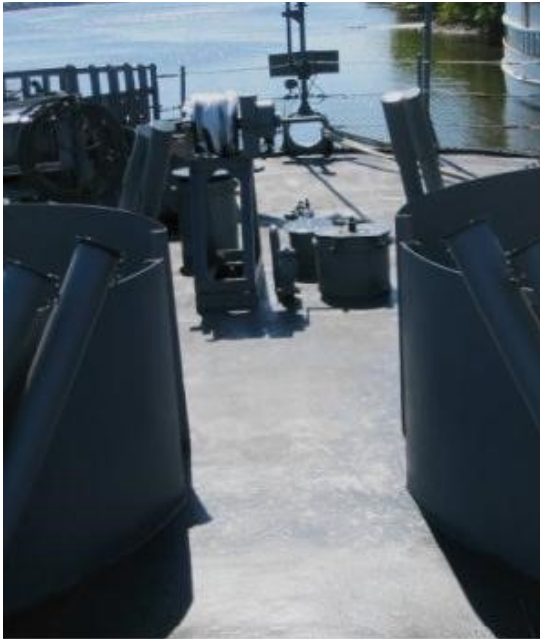
The fantail recently received a fresh coat of paint after a thorough chipping job.

As summer wanes, it's routine maintenance and moored as before for the crew of the SLATER. The welders are working on repairing the 20mm ready service lockers, the electricians are working on compartment fans and battle lanterns, the gunners are working on number 1 three inch and 40mm gun 42, and the deck force painted out the fantails and is moving forward along the portside with the chipping. Gary Sheedy is redoing all the expanded metal in the electrical storeroom off the reefer deck, and showing considerable talent with steel fabrication. Tommy Moore has been using his new paint float to scale and paint the portside between the camels. The signalmen have rigged retrievers on the outboard halyards, and keep repairing signal flags, so we don't have to buy new ones.