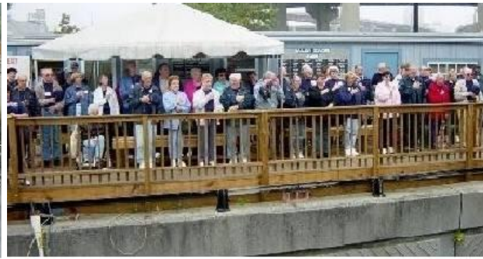
The USS CHILTON APA38 Reunion.