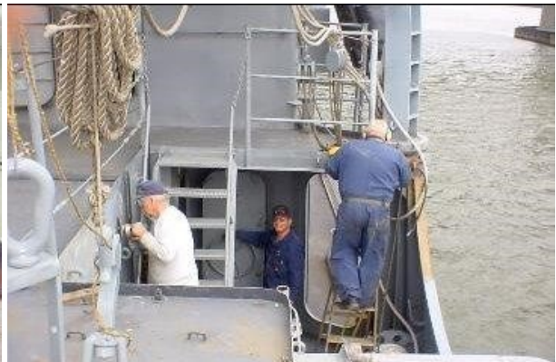
The Michigan painting crew at work.