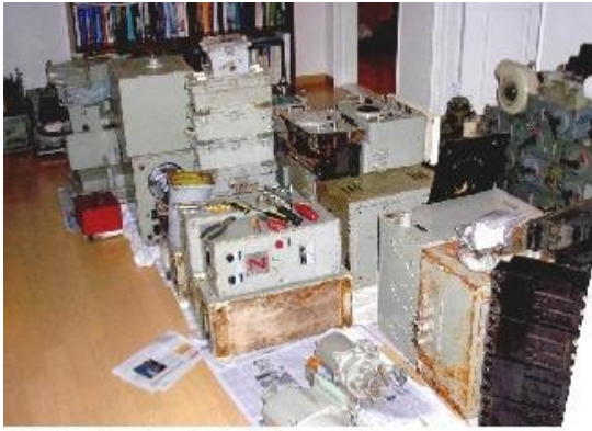
Moving day for Captain Krawczyk.