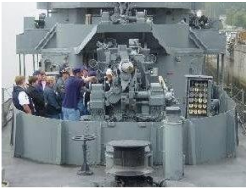
The USS CHILTON Crew tours the SLATER.