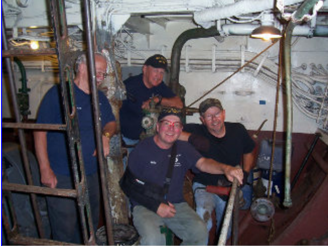
Happy engineers working on fresh water cooling for their diesels.