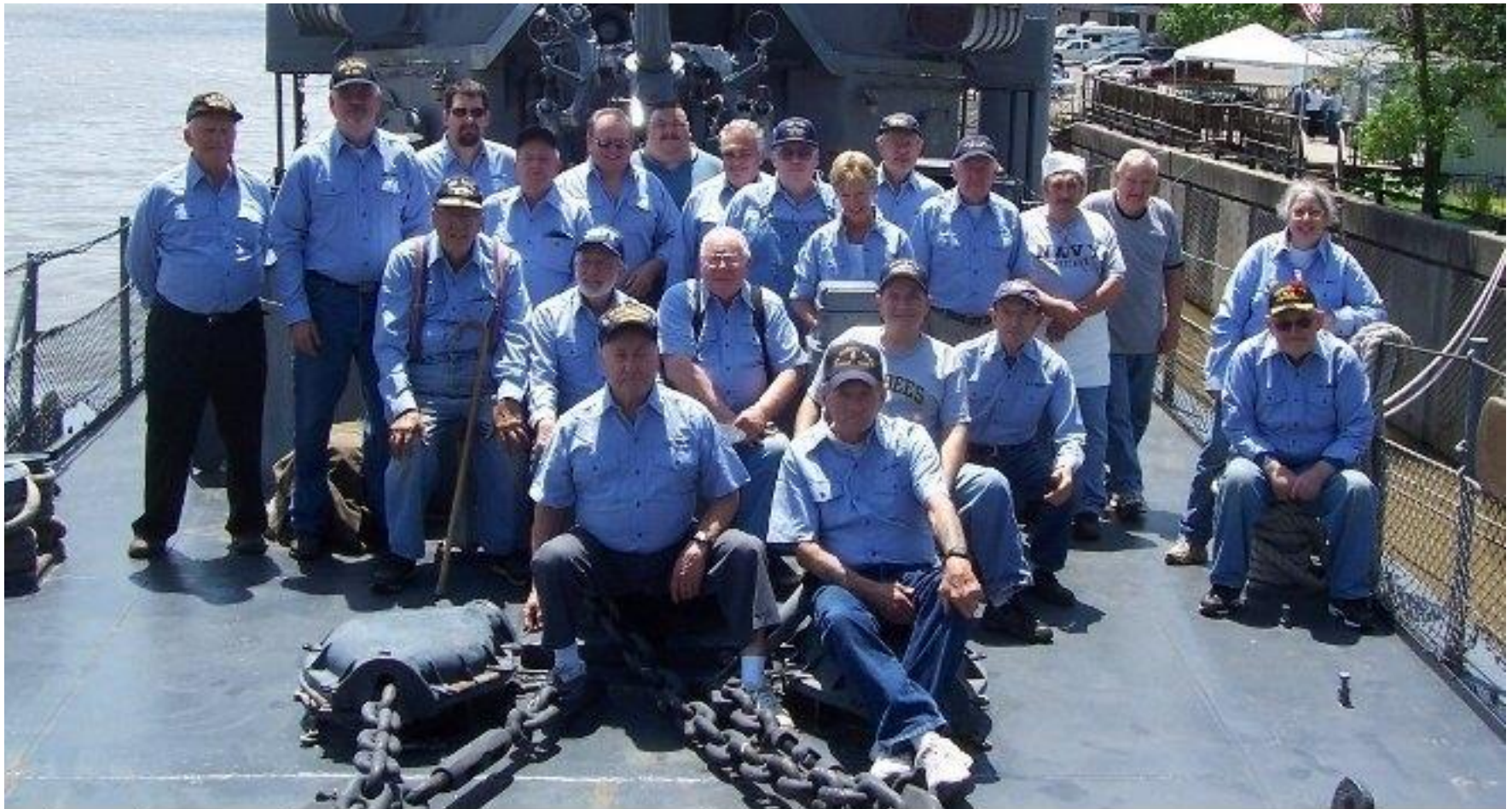
The volunteers from the USS HUSE Reunion Association.