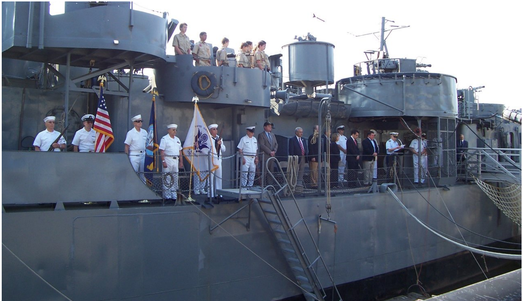
Memorial Day 2012 aboard USS SLATER.