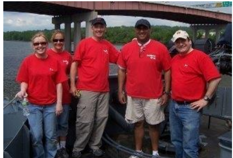
And once again, the Key Bank volunteers were a big help to us.