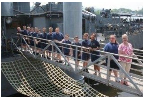
Summer camp tours have begun.

The Education Department continues to evolve. The Briefing Room is not only a library of reading material, this is where we begin all tours with a 7-minute video to introduce the significance of the Battle of the Atlantic and the Destroyer Escort in World War II. Our tour guides now have laminated maps that illustrate the "Allied Shipping Losses" spanning September 1939 to May 1943. Visitors witness the shift from "Germany and German-occupied Territory" to "Axis and Axis-occupied Territory;" follow the change from "convoy routes, escorted; convoy routes, unescorted" to simply "convoy routes." By April of 1941, air cover zones had become part of the battle plan, increasing their territories by August 1942. We see the defeat of the Axis Powers in North Africa along with an increase in U-boat sinkings. It's all very exciting to follow the Allies with each pulse forward, against the Axis.