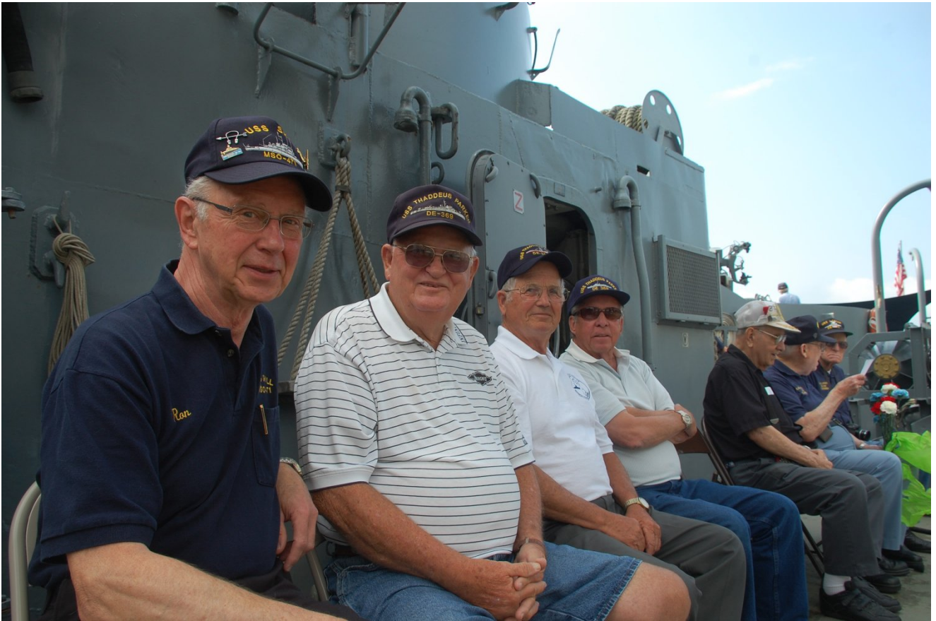
Veteran Sailors honor their shipmates on DE Day