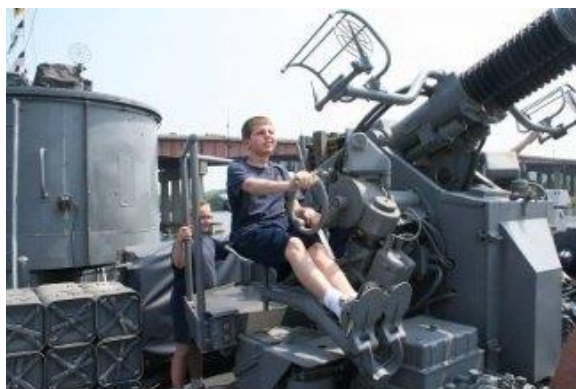
Which means the 40's get a workout.