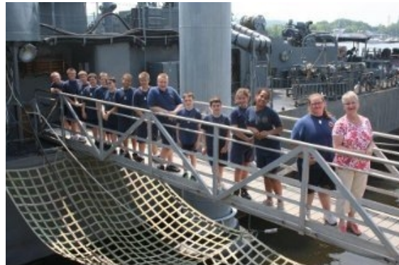
Summer camp tours have begun.