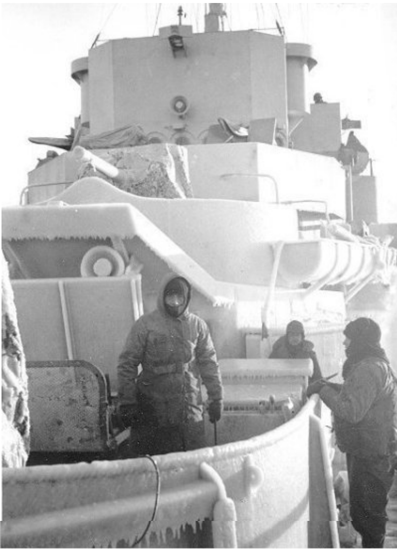
Another winter aboard SLATER.

So, now is the time we look to you to help us continue the progress the volunteers have accomplished. Sixty percent of our income continues to come from donations. It is a critical part of our income. In economic times like these, it becomes even more difficult than ever to ask for your support. Again, we would ask that if you can afford it, please donate one hundred dollars to help us get through the winter without dipping into our savings. If you find yourself in such financial straits that you cannot afford to donate anything, we understand and still want you to feel a part of the SLATER family. Just let us know and we will keep you on the mailing list. This organization stands for comradeship, companionship and compassion. If you are in a position to donate more, we would encourage that, to help make up for others who may not be in such a fortunate position following the economic downturn. I have always tried to lead by example, and ever since the Winter Fund drive first started back in 1998, pledged that I would be the first one to contribute. To all of you who are ahead of the curve, anticipated my plea and already donated to the 2009 Winter Fund Drive, we thank you. To the rest of you, please take the time to fill out the enclosed donation form.