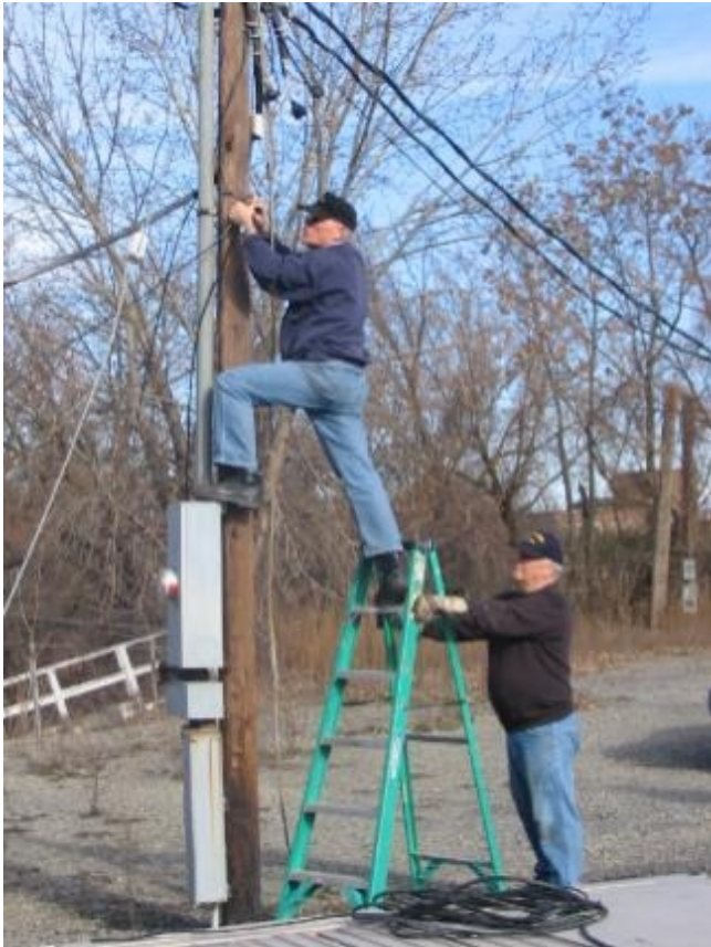
Hooking up the shore power in Rensselaer.

"Light Duty" trying to pull their weight by pulling on lines. 'm talking about you Clark, Don, Jim, Ernie, Tom and Bill. Last names are omitted here so you can say to your wives, "He means the other Bill." Over the next few days SLATER was buttoned up for the winter. Guns were covered, safety net rigged under the gangway, circulators rigged to prevent ice buildup between the ship and the pier, and all the water tight doors closed below the second deck aft as a precaution in case we are holed by ice. We think we've done everything we can do to protect her until spring, but we need your help to keep these guys warm all winter. Please support the Winter Fund again this year.