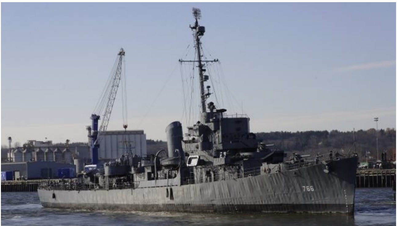
Approaching the Rensselaer dock.