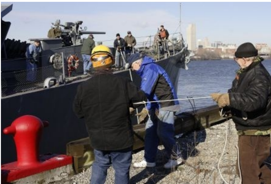
The forward spring line goes over.