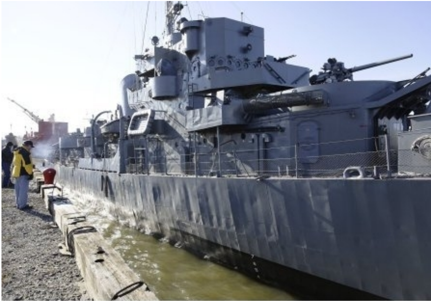
Ready to start throwing lines.