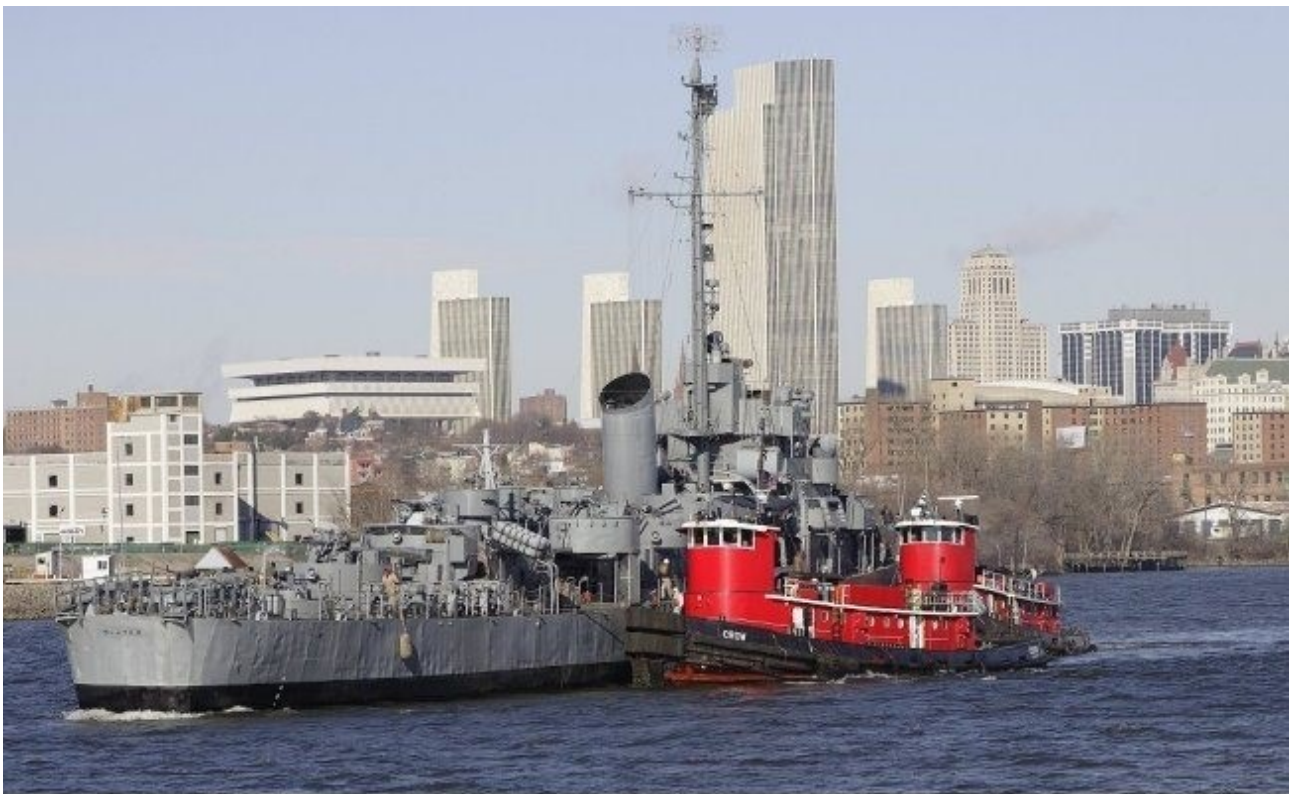
The tugs Crow and Cheyenne push us south against the Albany skyline.

You remember me? 'm the guy who comes around this time every year begging for money. Yes, once again it's Winter Fund time. Our annual campaign to help keep a volunteer warm this winter, so they can keep working on the SLATER all winter for you. We are going into this economic maelstrom in better shape than most. While we are not "Children of the Depression," we are historians by degree and pessimists by nature, and thus fiscally very conservative. We take the lessons of the past seriously and try to use that knowledge to prepare for the future. No matter how good things are, we know they can always get worse. And now, here we are, we all may be children of a depression. Because of that, we recognize that this is a most difficult time to be asking people to donate money. But, let me tell you a little bit about what you are donating to. We've accomplished a lot this past year, thanks to you.