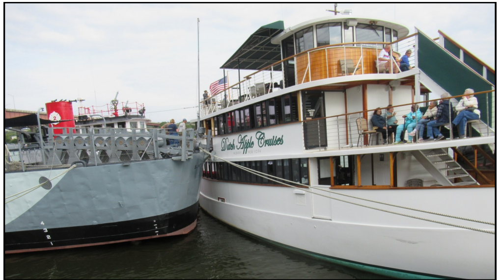
High wind held the Dutch Apple in place.

The big event of the month that brought us national attention, for those who haven't heard, was almost a non-event. The DUTCH APPLE, a local river cruise boat, had some kind of mechanical issue, lost way, and the wind blew her into our fantail. The only damage was a bent pipe on the starboard depth charge rack. The rack kept the hulls from touching. Fortunately, we had fireboat HARVEY alongside, with her bow projecting beyond our fantail. HARVEY's bow locked the DUTCH APPLE in position and kept her from being blown up-river. If that hadn't happened, the depth charge rack projection would have taken out all the windows on DUTCH APPLE. Pinned against SLATER and HARVEY by the wind, the tug JAMES TURECAMO was called and came to the rescue. Her skipper did a masterful job of pulling the boat away, and getting her back to her dock without doing any additional damage.