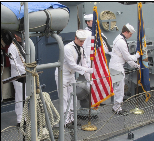
NSA Saratoga Springs provided the color guard.