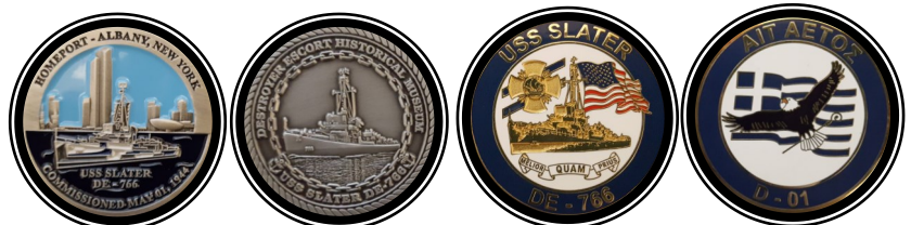
Challenge Coins for sale in the Ship's Store.