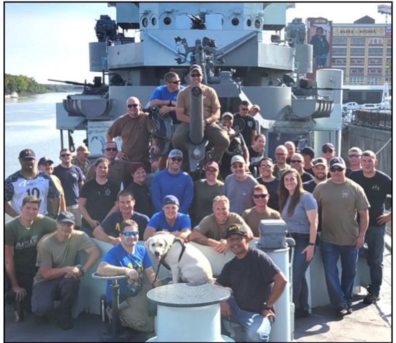
The New England Region Chiefs and Chief Selects gathered for a photograph on and around Mount 31.