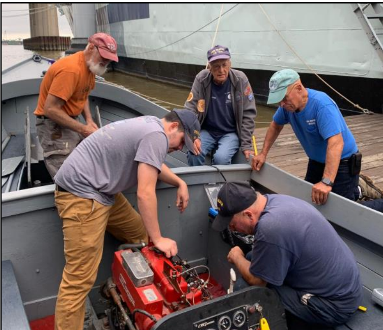
Our Westerbeke diesel has fuel pump problems.