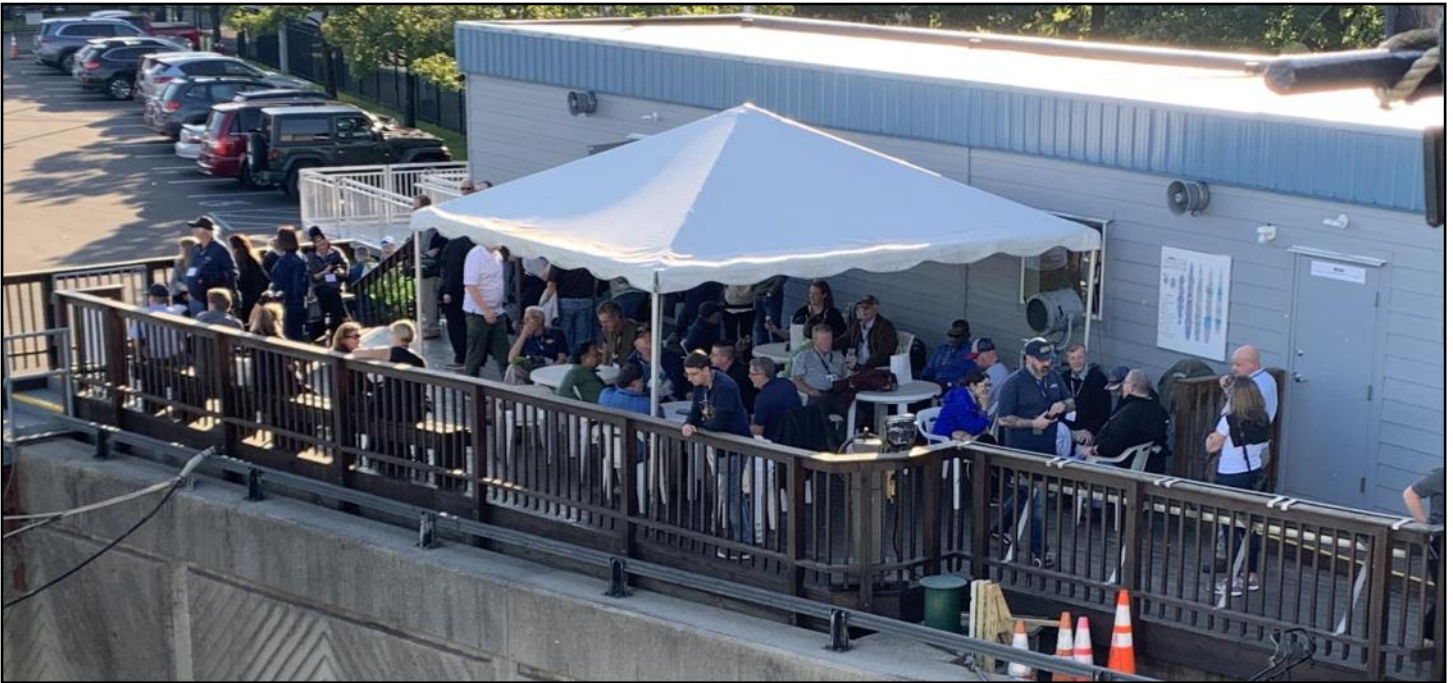
Over 130 HNSA attendees filled the ship and the shoreside deck for their tour of SLATER.