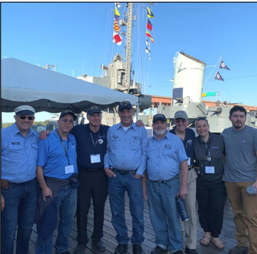
A few of the SLATER crew who were aboard to greet the HNSA attendees.