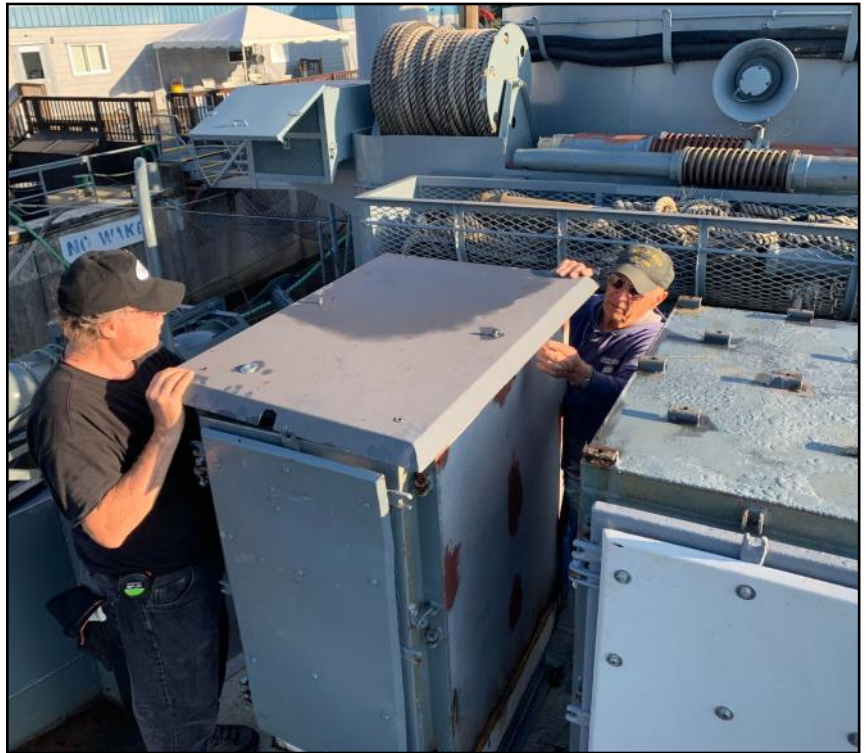
The shipfitters mounted the heat shields on the gun 33 ready service lockers.