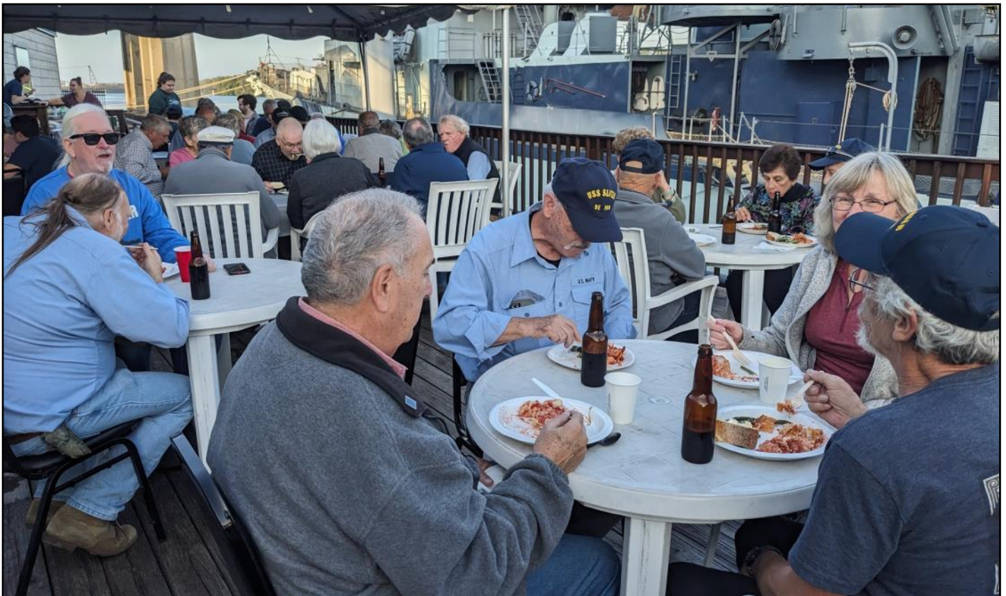
Everyone ate well at our annual Volunteer Appreciation Dinner!