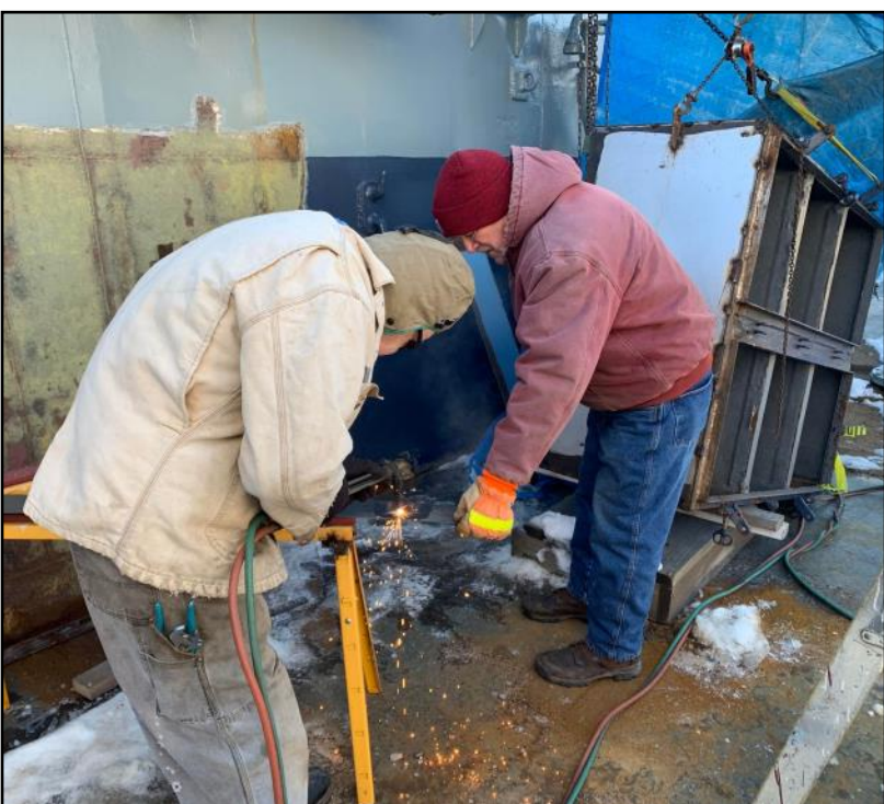
They completely replaced the bottom of the “safety gear locker”.

severe corrosion, so the locker was removed for restoration, and so the bulkhead could be accessed.