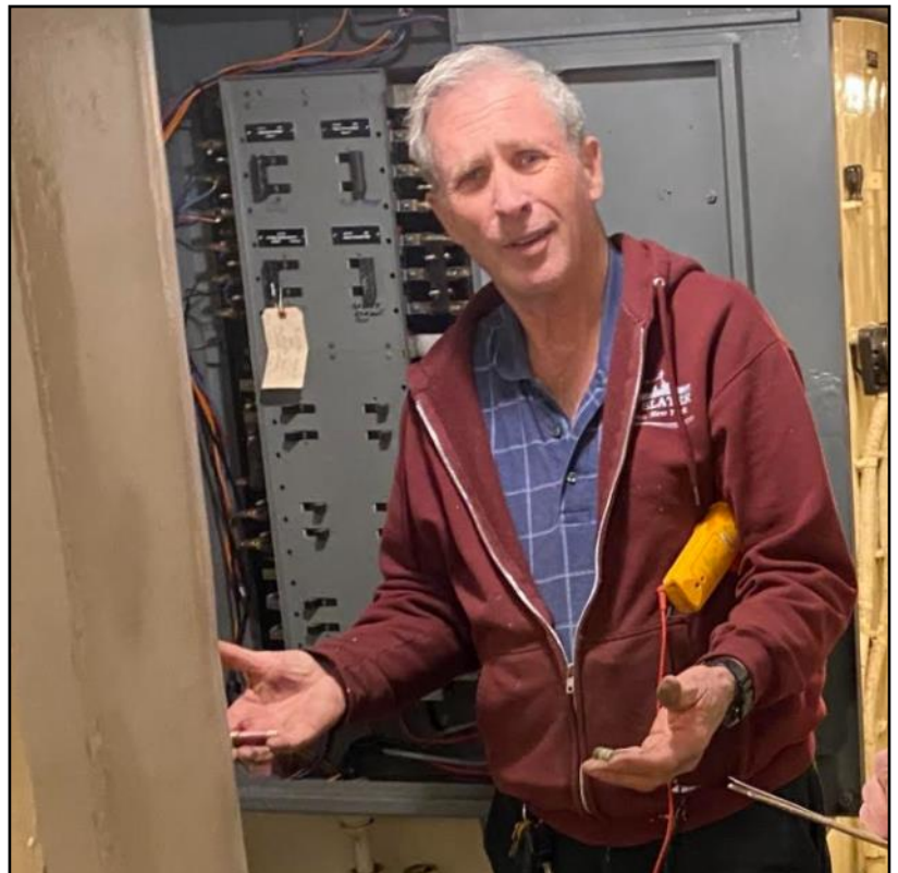
"I can't find that bucket of fuse caps anywhere".