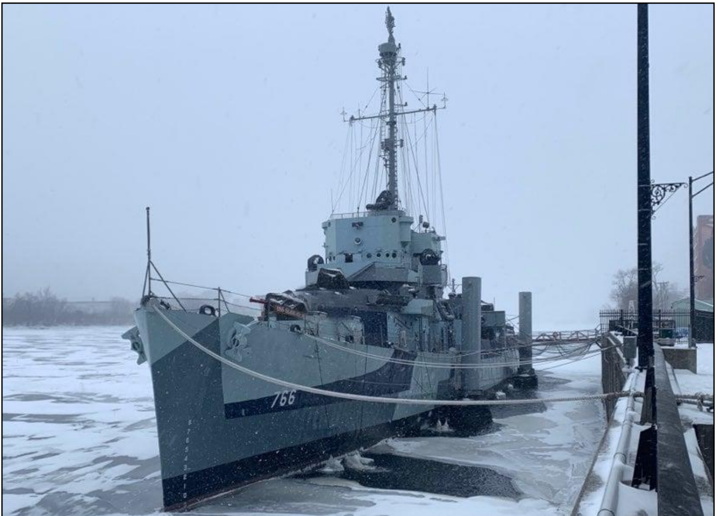
It certainly has been one miserably cold month.