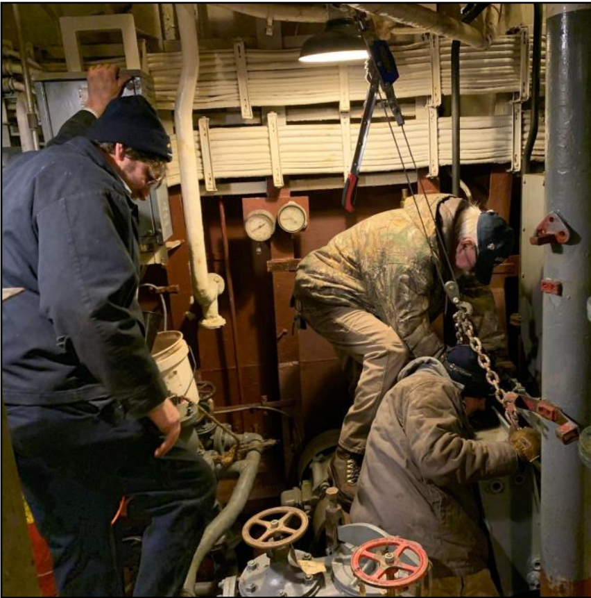
Our engineering gang removed the fire pump priming tank to access the area under the generators.

season. She has hired two new interns so far and looking forward to a couple more. Speaking of which, if you know of any college students looking for work who love history or ships, send them our way! We pay and train! April 6 th , opening day will be here before we know it!