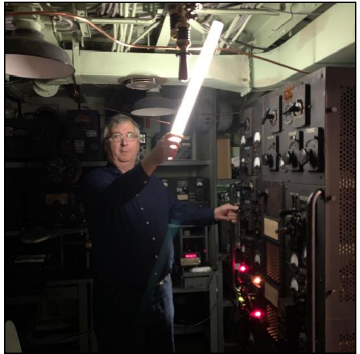
Proof that the TBL transmitter is putting out power.