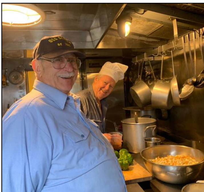
Happy cooks, happy crew!