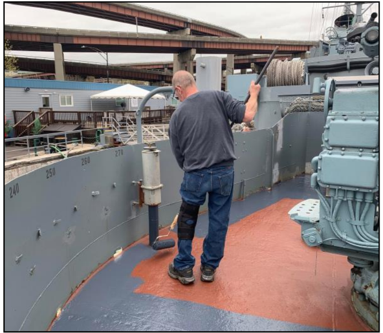
We got the deck painted out in gun 33.