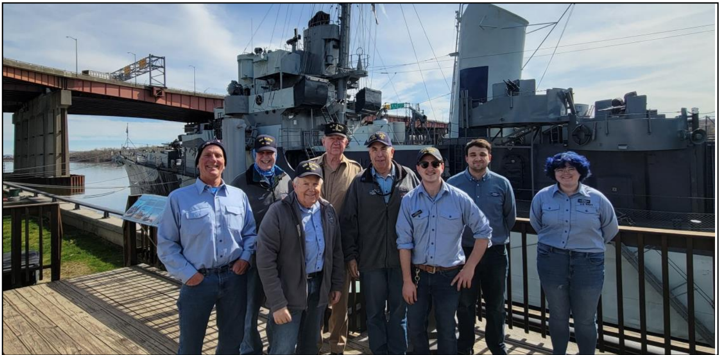
We've been slacking on our tour guide pictures this season so here's the Wednesday crew.