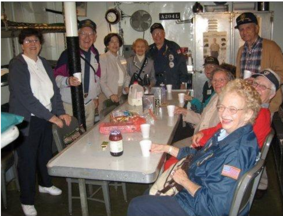
Members of the USS RHOADES reunion meet for coffee in the SLATER CPO quarters.