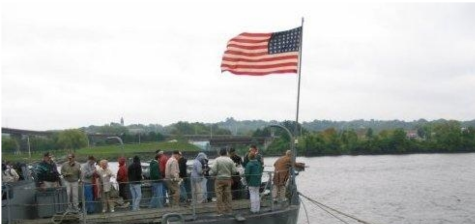
Dropping carnations into the water in memory of lost shipmates.