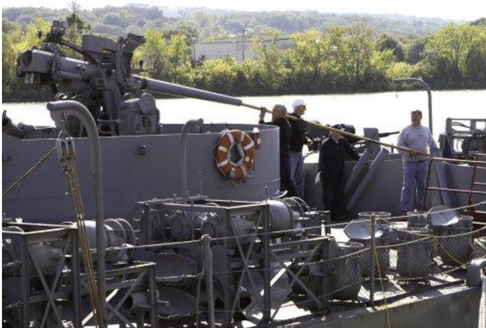
The rule is: "You shoot it, you clean it"!