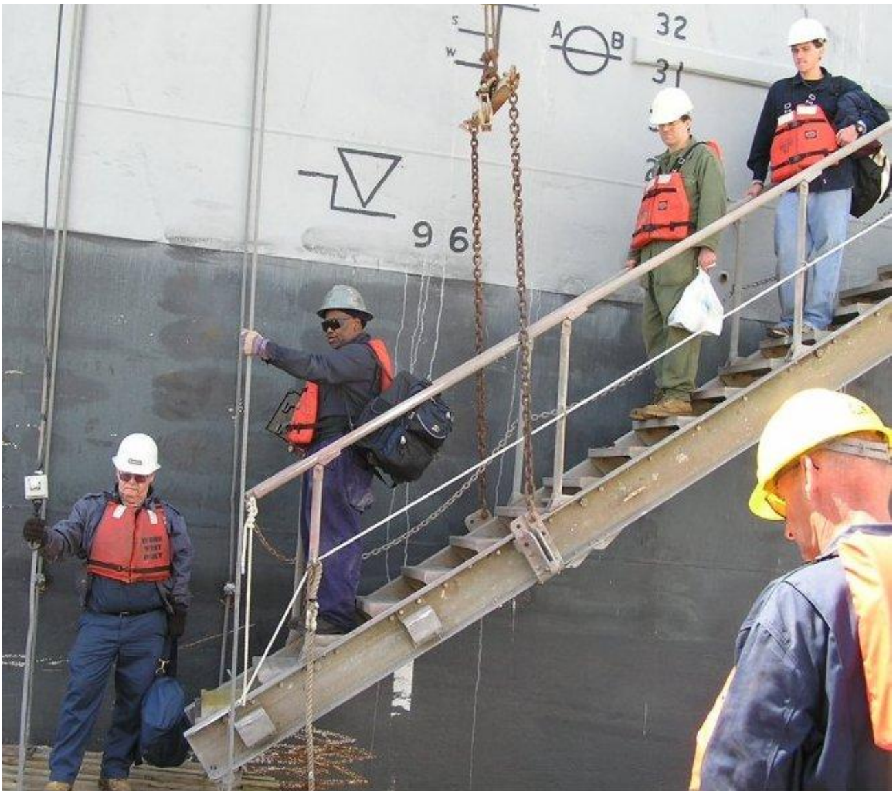
The exhausted crew at the end of a hard day of salvage work.