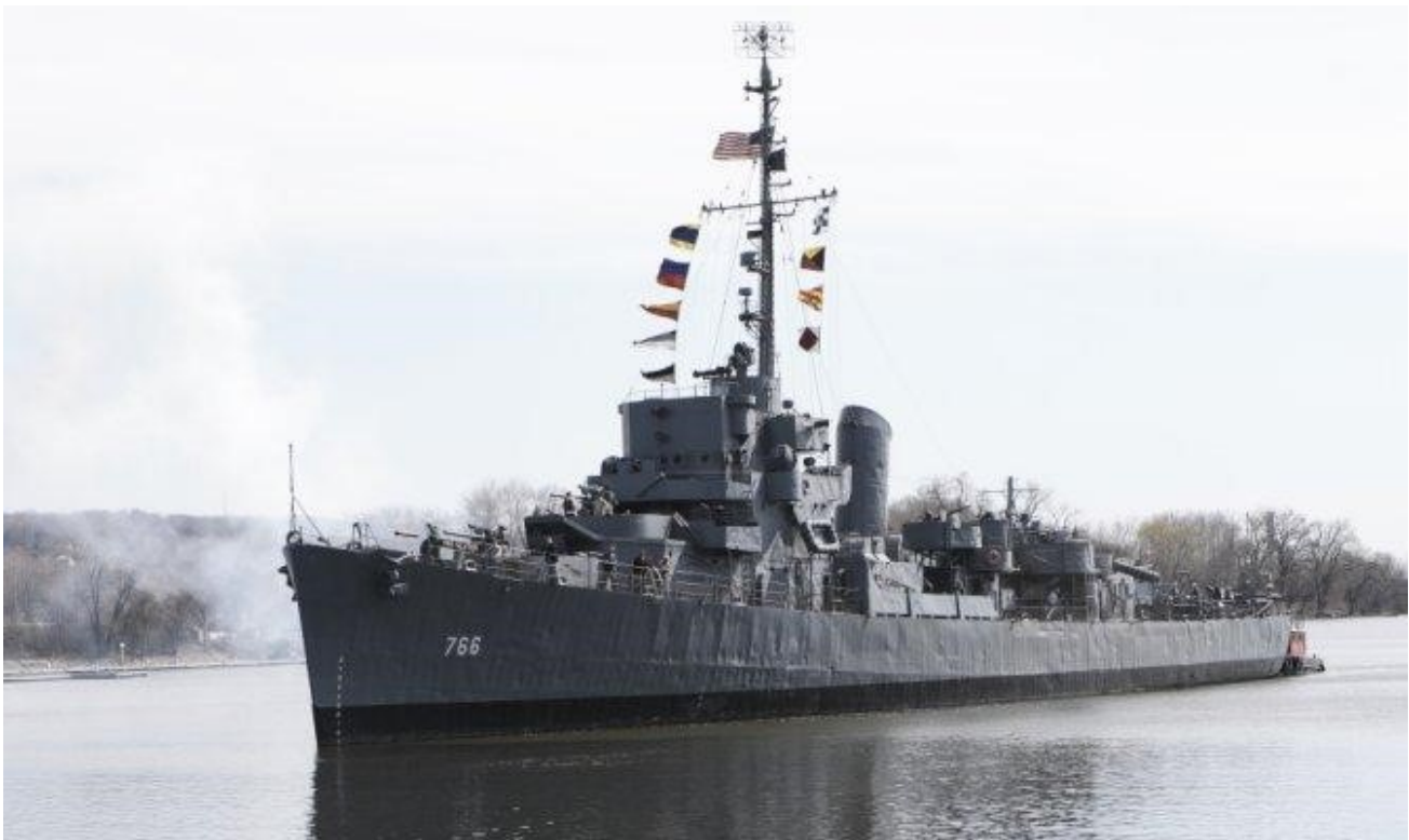
The smoke begins to clear after firing the number 1 3"50 upon returning to Albany for the summer.

Phone (518) 431-1943, Fax 432-1123 Vol. 9 no. 4, April 2006