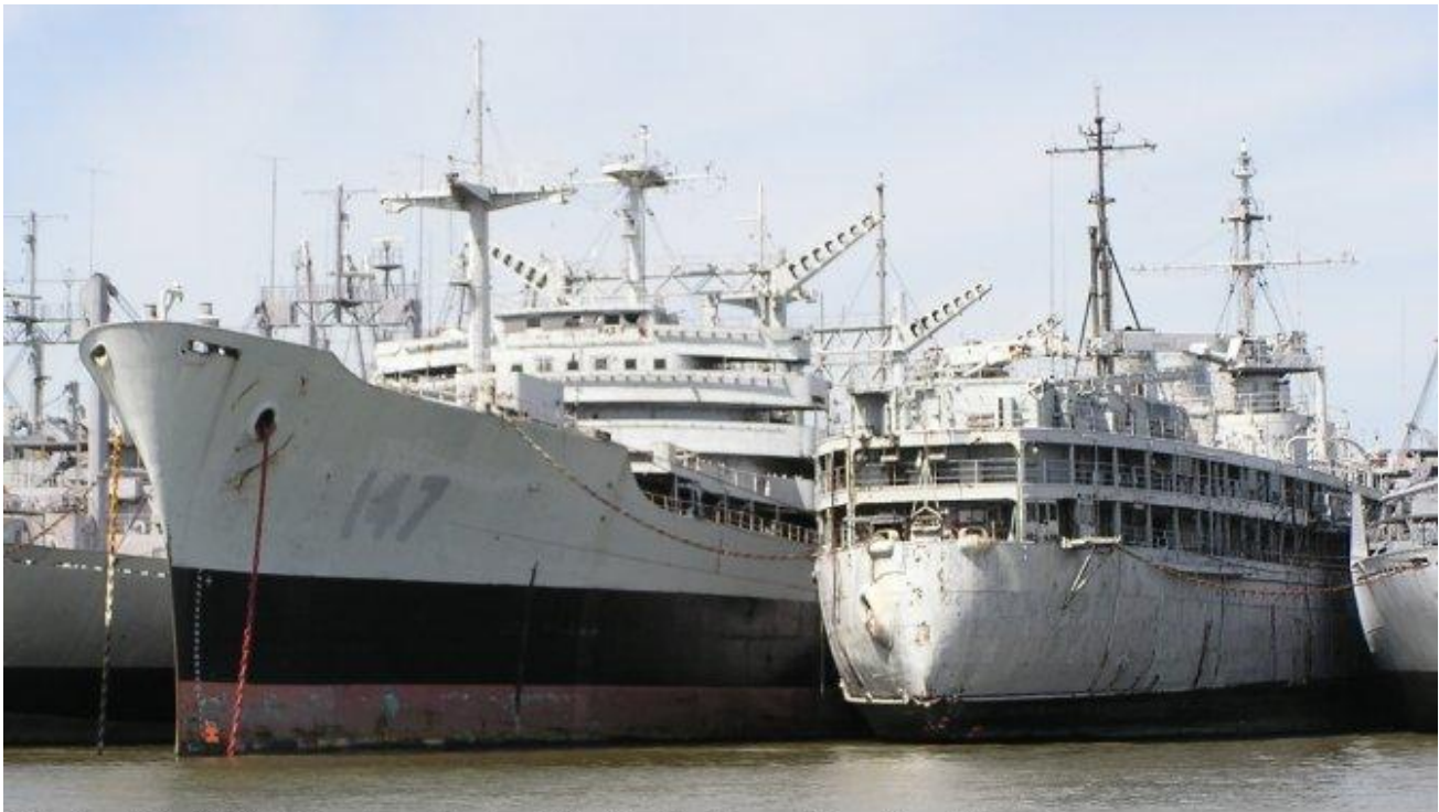
The fleet oiler TRUCKEE and sub tender ORION in the James River Ghost Fleet.