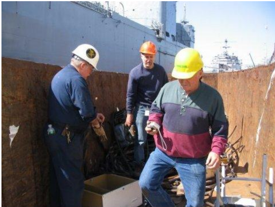
One man's treasure can be found in another's dumpster!