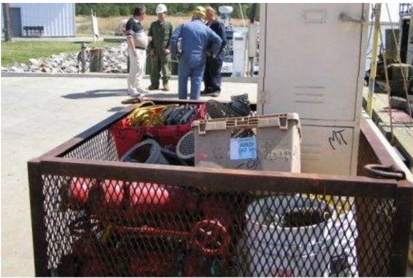
The basket of spare parts ready for the SLATER.

CLAMP is one of the few ships left that has seen no postwar service. Though pretty well stripped out, she still has the original SL radar console aboard, and all the support equipment including the radar antenna, dome, and wave guide. Rich went back and photographed all these items for us. We began working towards permission to obtain this gear. The vessel was first on donation hold as