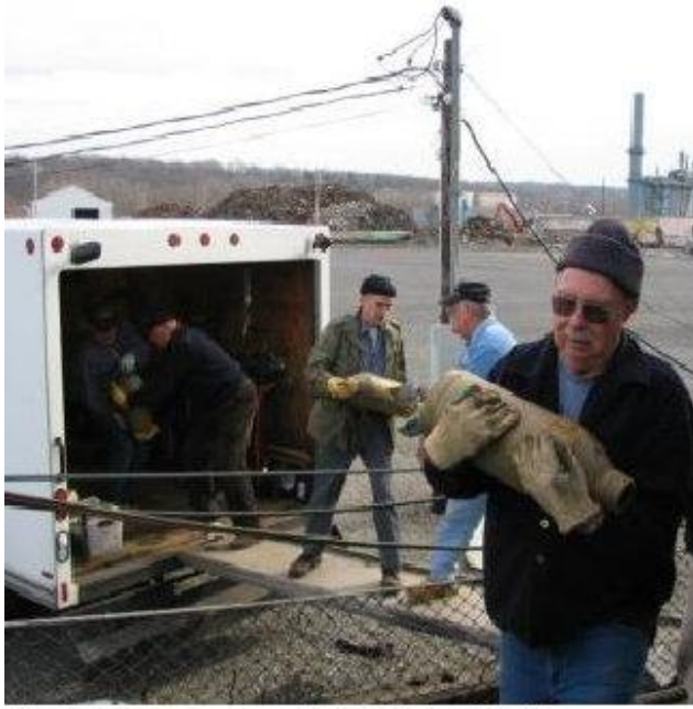
Hauling ammo onboard is the highpoint of every sailor's day!