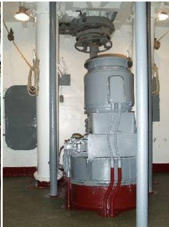
The newly painted out Anchor Windlass Room is a show stopper.

volunteers are coming and going. Access to the ship is very limited, but we can be reached on board through the direct line to the ship at 518-463-0140. If you're bringing non-working visitors in to see the ship this winter, please have them sign the guest logbook in the Chief's Mess. We're trying to get a handle on just how many visitors we have during the winter months. This is important for our annual attendance figures. These numbers are reported to various tourism and granting agencies. You may want to mention to any guests to call when they arrive at the gate so we can let them in.