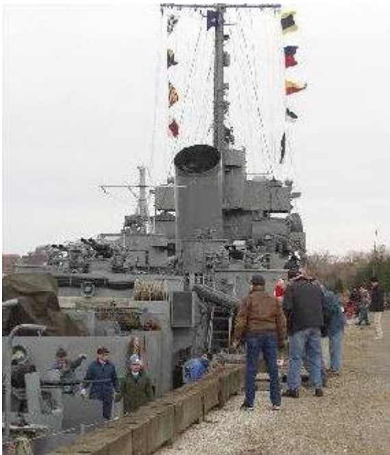
Arrival in Rensselaer.

"Tell those guys they paid the bill years ago with their service to this country." He was a man who appreciated what you veterans did for him.