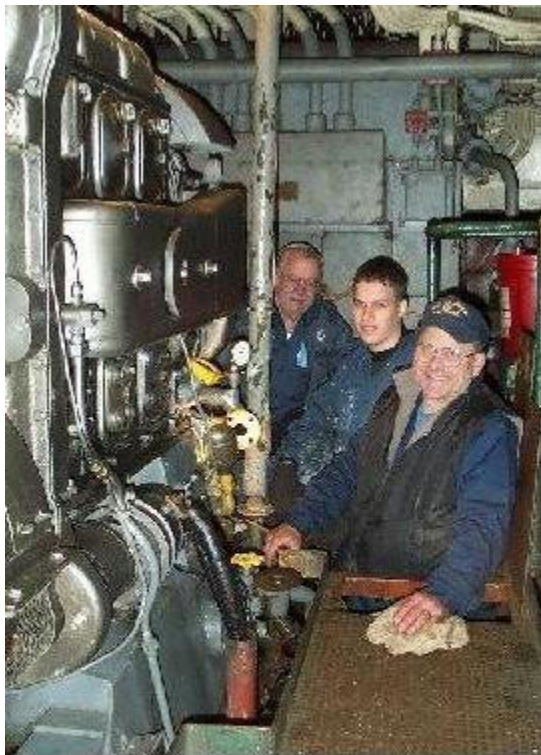
The engineers aren't happy as they try and diagnose the diesel problem.

Here, we are inside the jurisdiction of the Port of Albany and fall under the shadow of the new Maritime Security Act. We are required to keep the gate locked at all times except for a brief period in the mornings and afternoons when the