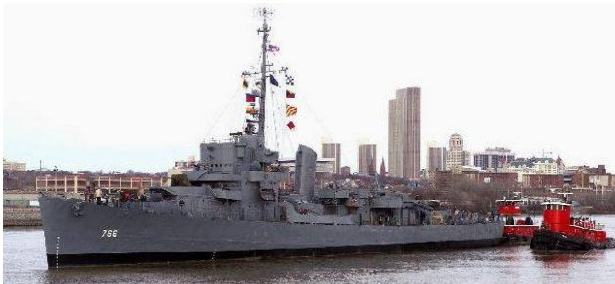
The Herbert and the Crow moving us downriver.