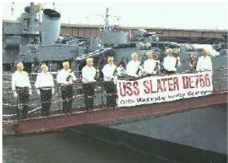
The members of the Saratoga National Honor Guard board the SLATER for DE Day.