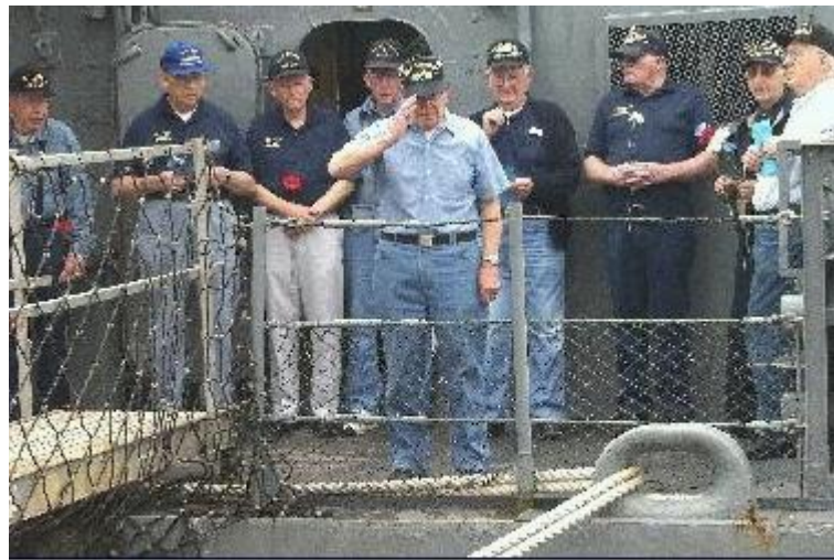
CAPDESA Members Remember their fallen shipmates.