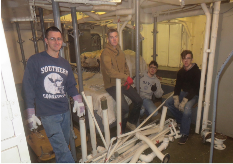
Post-war modifications removed from berthing space C-203-L.

winter long, in miserable conditions, without compensation, to get the ship ready for our visitors come spring. They are an amazing crew.