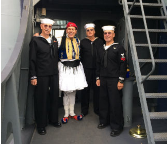
Our OXI Day color guard was a little more colorful than usual.

This fatal diversion proved to be a great advantage for the Allied forces. Winston Churchill paid homage to the Greek resistance by claiming, "...until now we would say that the Greeks fight like heroes. From now on we will say that heroes fight like Greeks."