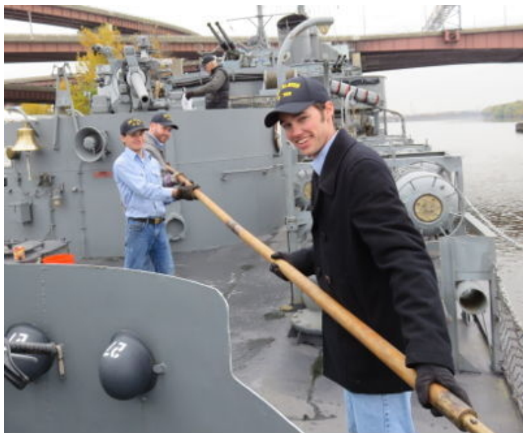
Cleaning gun three after the Navy Birthday salute.