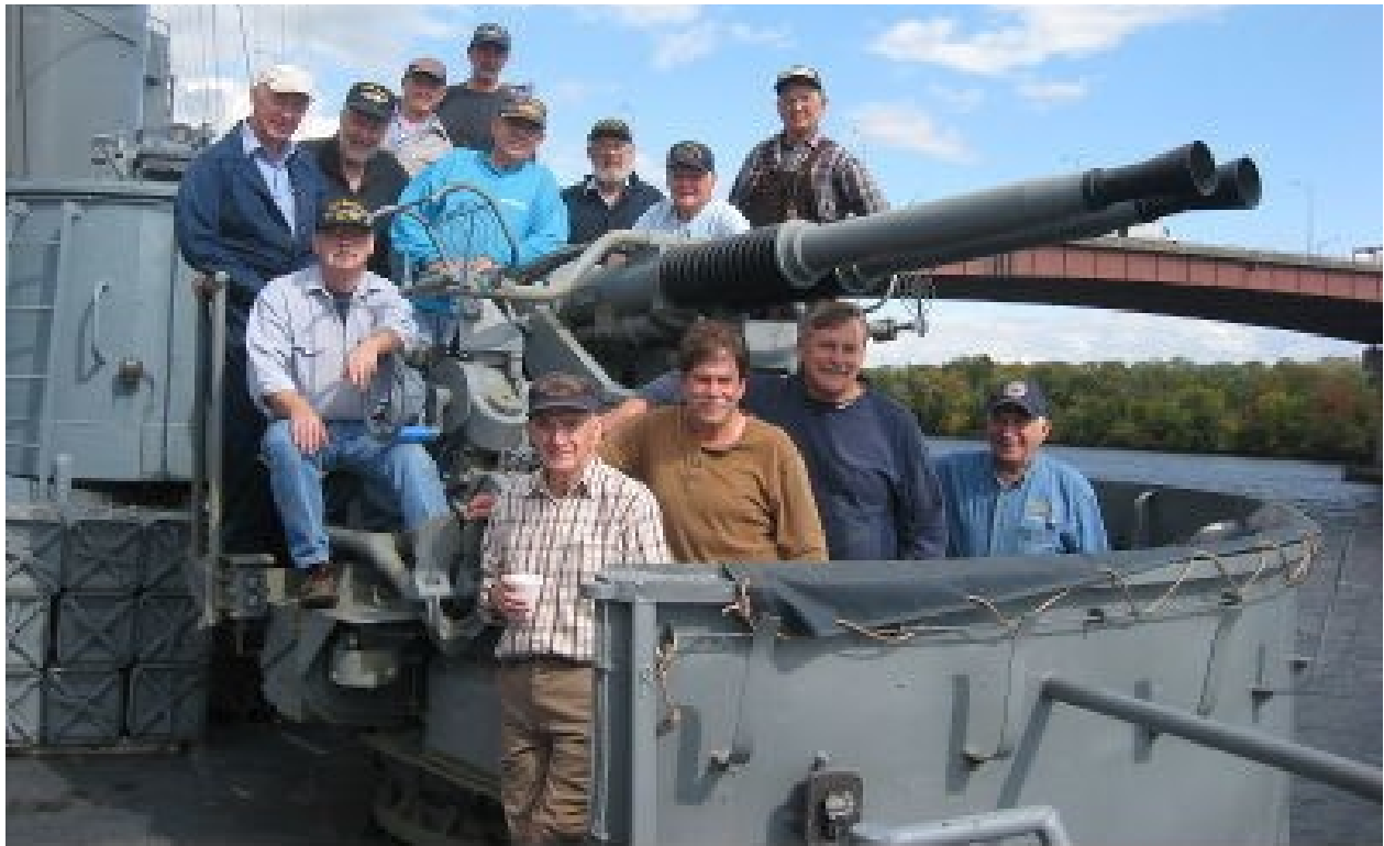
The fall work week crew.