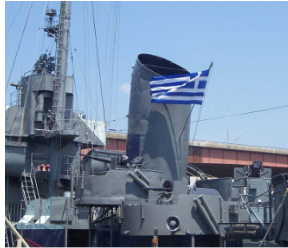
Flying the flag of Greece on OXI Day.