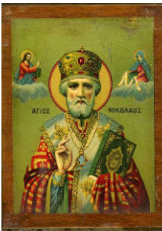
Our St. Nikolas icon has been watching over us.