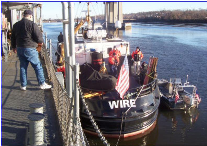
Lending a helping hand to the Coast Guard by providing an overnight berth for the USCGC WIRE.

Most of you have seen first-hand the incredible accomplishments of our volunteers. Most recently, the restoration of the reefer space, the ongoing work in the aft machinery spaces, the radio shack, the restoration of the 20mm guns and our beautiful motor whaleboat and the continued restoration of our watertight integrity to all compartments forward and aft of the machinery spaces. But, while all this is going on, the bills still need to be paid. The insurance, utility bills, supplies for the volunteers all need to be paid for. This is where your donations to the Winter Fund play such a critical role during these months in keeping us from having to draw down our savings and enabling the Endowment and Hull Fund to continue to grow and thus ensure SLATER's future.