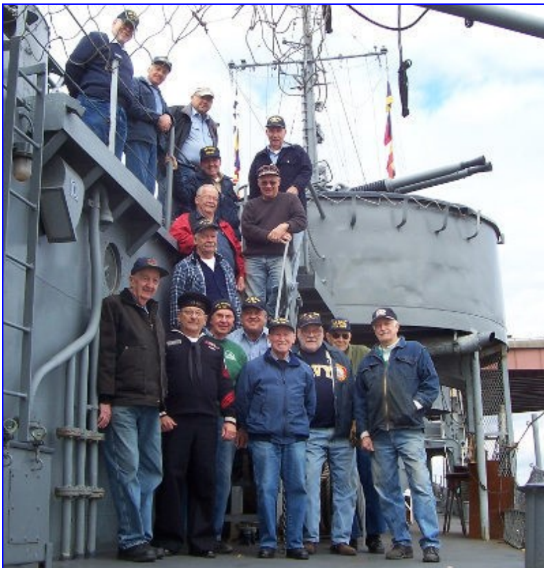
SLATER Volunteers celebrated Veterans Day working on their ship.

This is the time of year we ask that if you appreciate what we are doing to preserve the USS SLATER, please go to our website at and hit the donate button. It's Winter Fund Drive Time.