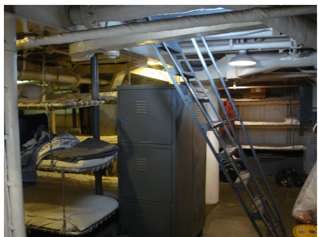
The aft crew compartment