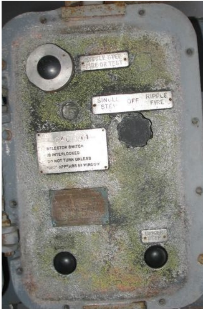
The hedgehog firing panel before...