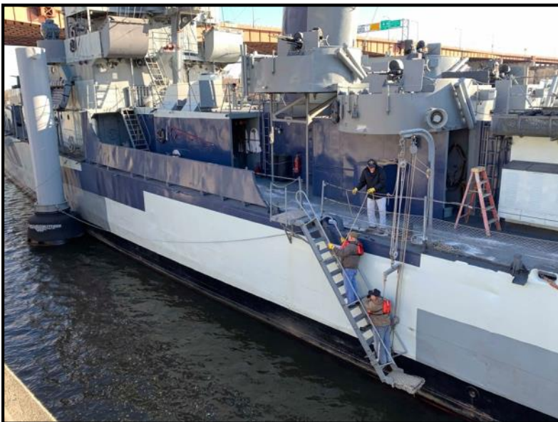
The deck gang brought up the accommodation ladder.