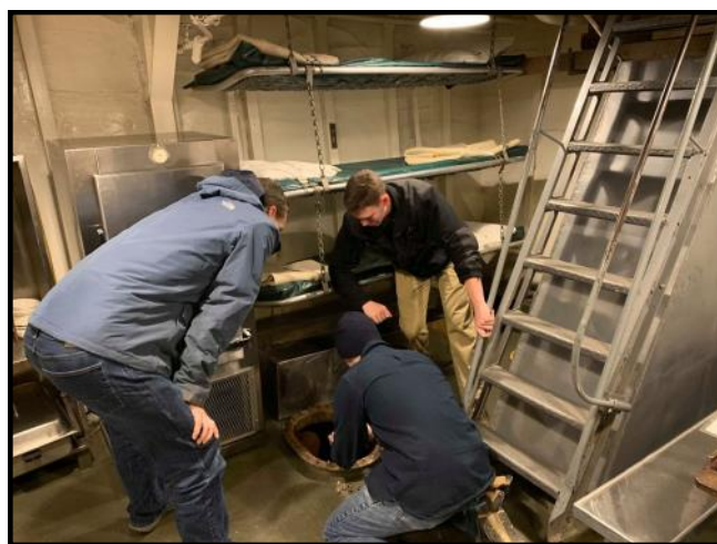
Our RPI Midshipman volunteers did the annual inspection of tanks and voids.