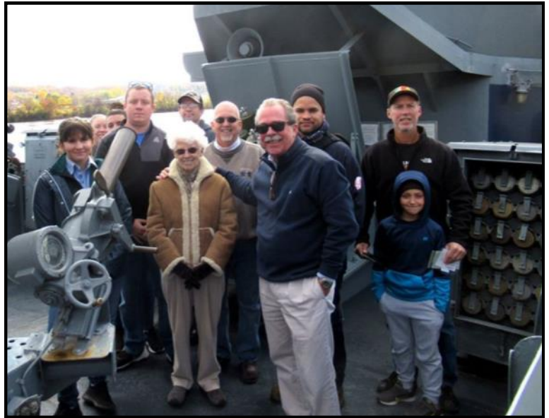
We welcomed the Lasch family aboard as one of the last tours of the season.

In April, we opened for tours. I am always in awe of all of the passion our volunteers put into this project. I always say that the tour guides don't get as much attention as they deserve. Photos of the tangible progress that the maintenance crew makes are amazing. But, without the tour guides getting visitors aboard and showing off all of our progress, maintenance would run out of funds to keep their work moving.