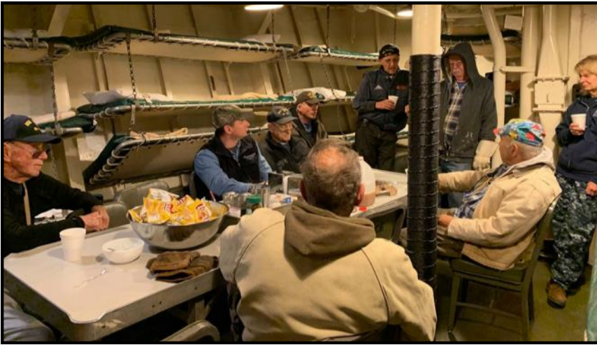
It takes a lot of coffee to get this crew through the winter.