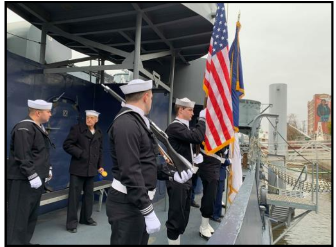
NPTU Ballston Spa provided a color guard for our Veterans Day Ceremony.

Then the process of fabrication began, using our local volunteers, Ed's crew, as well as RPI students and midshipmen. Through the RPI students we have access to a water jet cutting tool, which was very useful in the process. Among the parts fabricated were a new whistle platform, the surface search radar maintenance platform, new running light supports, and all six recognition (a.k.a. "fighting") lights. The IFF (Identification friend or foe) antennas that we acquired from LSM-45 in 2010 were restored. Dan Statile and Dave Wasson had a good time learning to fabricate replica waveguide from square tube. In an effort to save some money in the shipyard, Barry Witte and two Midshipmen climbed the mast and removed most of the old armored cable. That cable will be replaced with new cable in the shipyard. RPI Junior, Jack Carbone , has been doing a superb job, leading a handful of midshipmen who he coordinates to volunteer each Saturday.