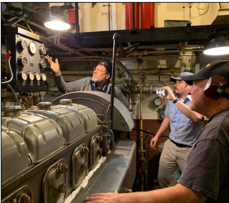
Our YouTube video of the 8-cylinder engine starting has broken all our records. Over 25,000 views and counting!

The engineers had a great month that resulted in firing up the 8-268A GM diesel for the first time since we got back from the shipyard in 2020. The engine had been sitting cold for two years. Dealing with these engines is never as easy as turning the key and starting it. There are several checks to make, outlined in original Navy service manuals, and we are fighting an almost unlimited number of leaks, age, and wear issues. Over the past year, we took on several projects which allowed us to safely run this generator.