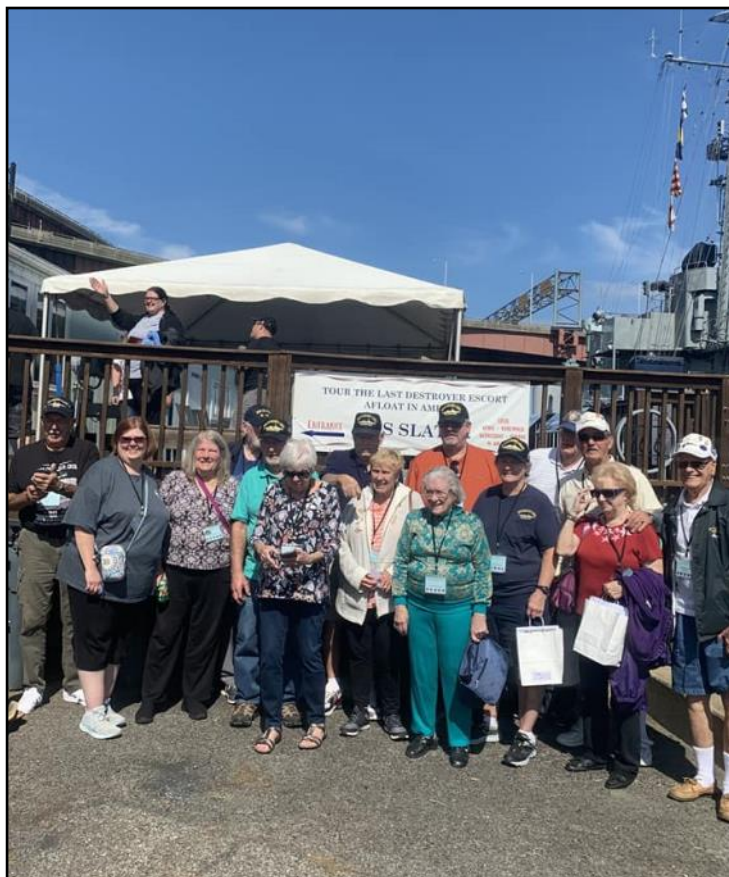
USS CHARLES P. CECIL reunion group.