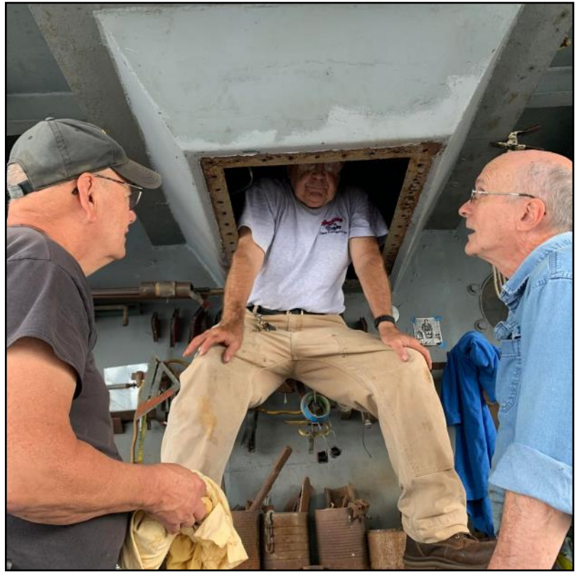
If we can push him a little higher, we can bolt the cover on.

The maintenance crew continued working on several projects. One of our continuing problems has been water lying in the stuffing tube wells of our twin 40mm gun mounts. Starting with gun 41, the shipfitters drilled a drain hole in the well base, and then worked out a drainage system in the junction box below the gun mount. This involved opening up, scaling, and preserving the inside of the junction box. If this fix is successful, we will do the other two mounts.