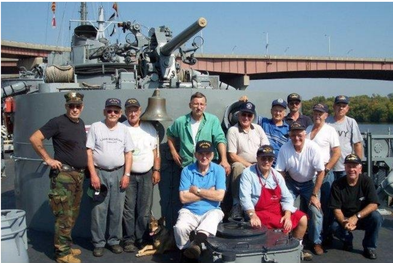
Some of the Michigan Field Day crew take a break for a photo.