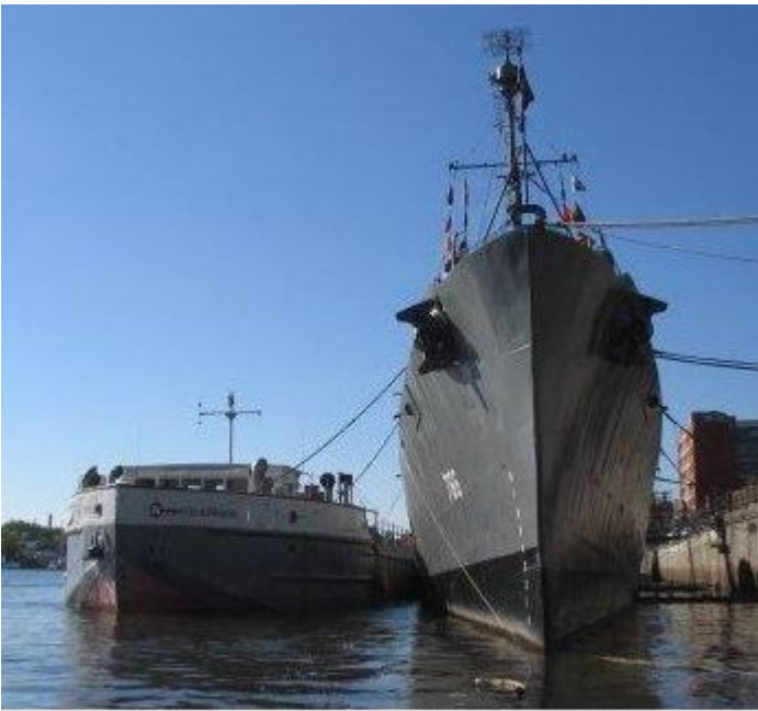
The motor barge DAY PECKINPAUGH moored alongside the SLATER for PortFest.