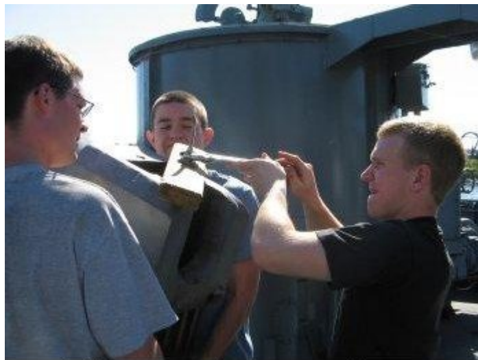
RPI Midshipmen work to remove the 3" practice gun breech block.