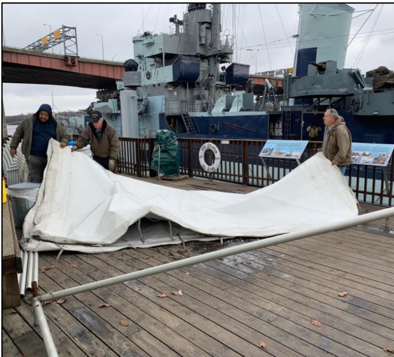
You know its winter when the deck canopy comes down.