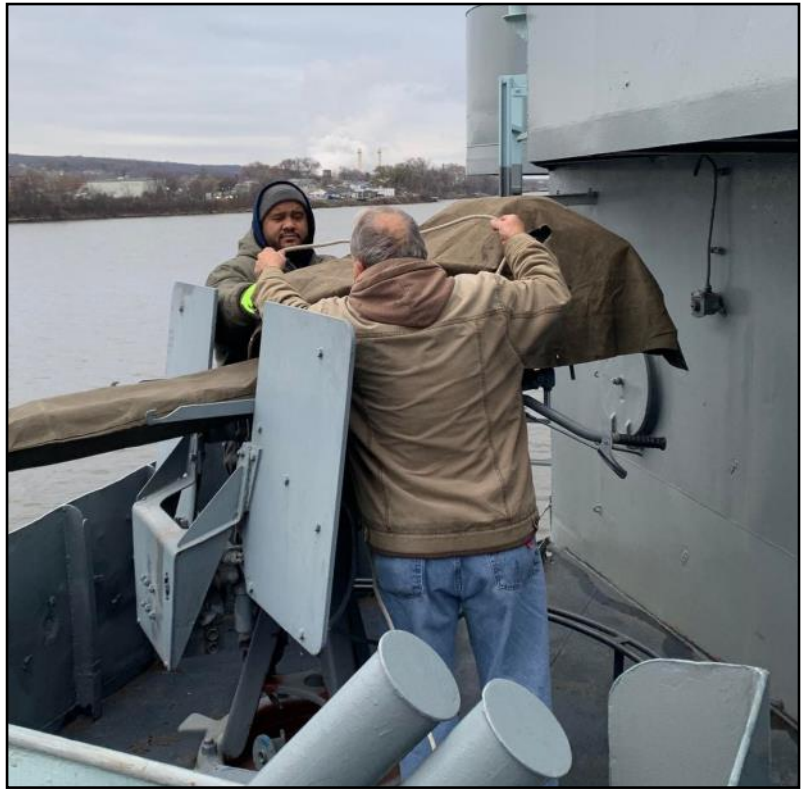
Let's get the guns covered before the snow accumulates.