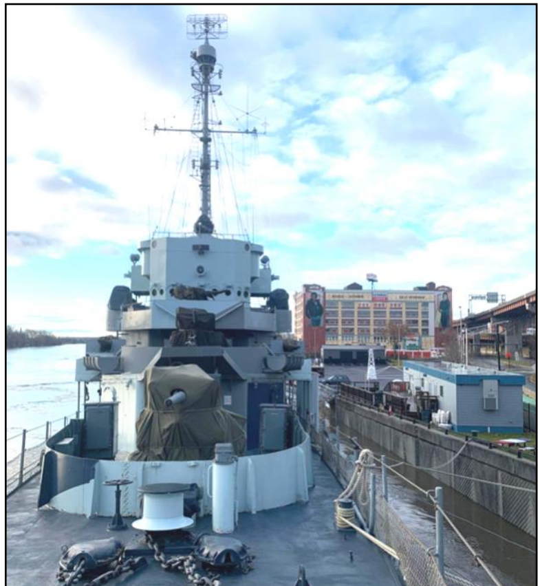
The guns are covered as we wait for spring.