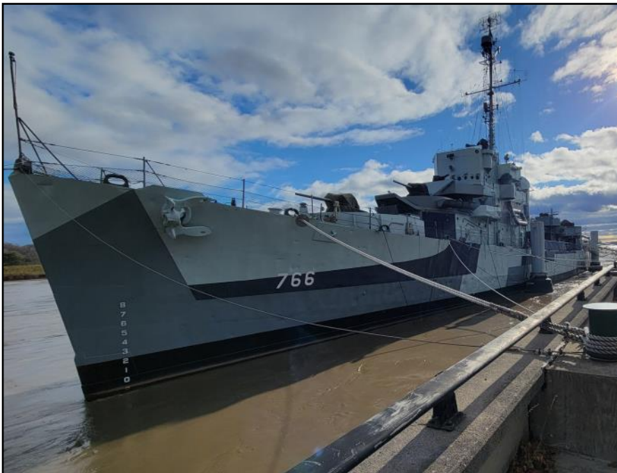
High water on 18 December.