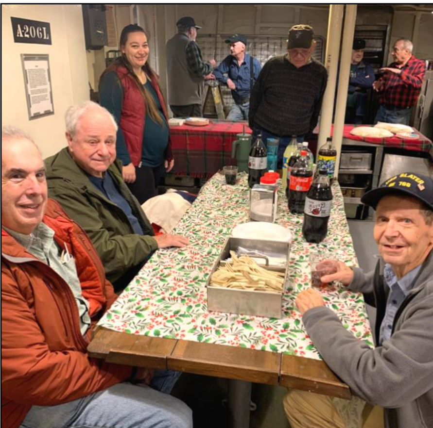
This crew is ready for their Christmas lunch!

DEADLY, is that we have a way of making people feel that they know the volunteers. People are able to follow the progress and be part of the project through all the twists and turns they each bring. That creates a feeling of community that helps so much when we make the Winter Fund appeal.