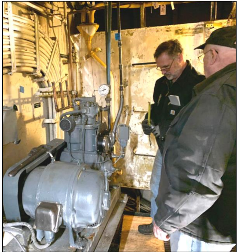
Investigating the starting air compressor.

The next goal is to overhaul the Ingersol Rand starting air compressor . The book describes it as a "Class T" 600 psi unit, but the folks at Ingersol Rand haven't been able to find any information on the unit, so the search for parts is at a dead end.